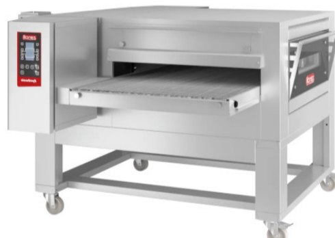
Zanoli Synthesis Gas Models