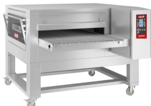
Zanoli Synthesis Electric Models