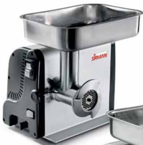
TC 8 VEGAS