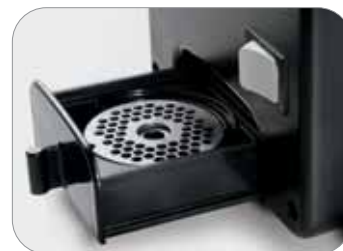
Compartment for knife and blade