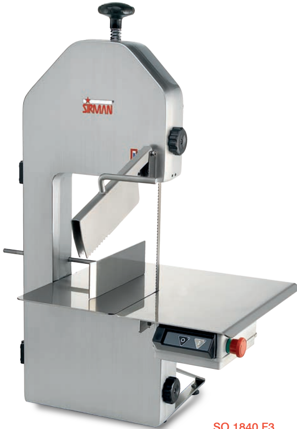
SO 1840 F3