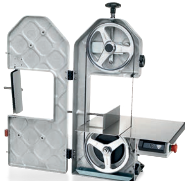
SO 1840 F3