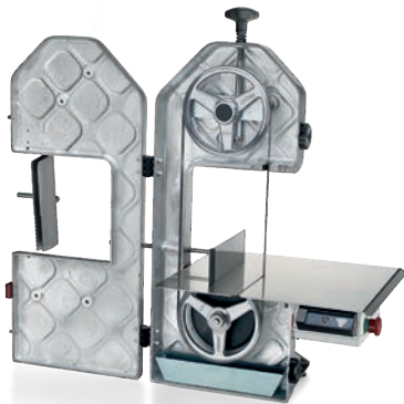
SO 1650 F3