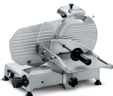
MIRRA 250 C VERT.