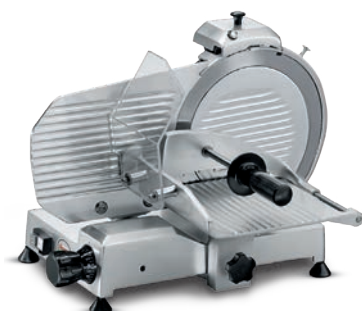
MIRRA 275 C VERT.