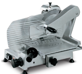
Mirra 250-275 C VERT. BS