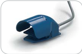
Optional pedal controls