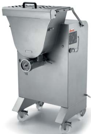
MASTER 30 Y12