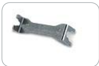
Plates removal tool