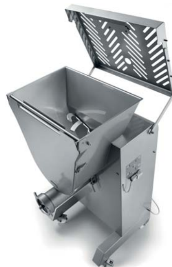
MASTER 90 Y 12