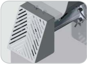
> Optional: interlock protection for more than 8 mm holes plates.