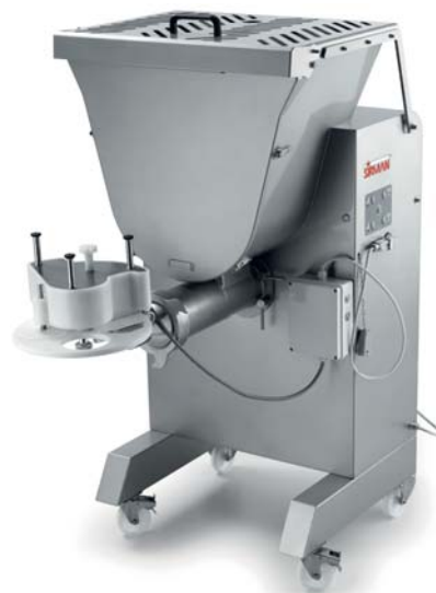
MASTER 90 Y12 con FORMAT A