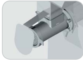
Optional: splash guard