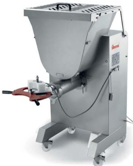
MASTER 90 Y12 con FORMAT S