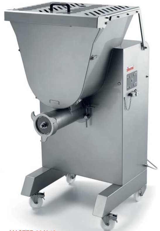
MASTER 90 Y 12