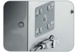
Full Control system (for Format S-A)