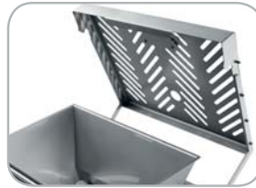
Lid with self lifting