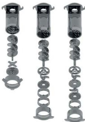
Standard o enterprise 1/2 Unger Unger Totale