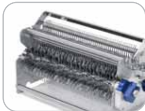
Tenderizing knives with 96 blades