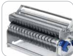
Meat strip cutter 8 - 10 - 15 mm