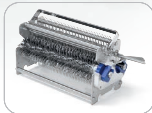
Tenderizing blade assembly with 96 blades