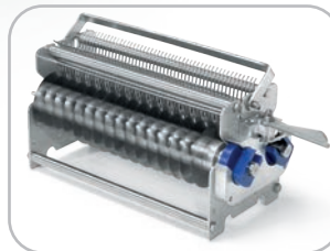
da 10 mm con 48 lame da 15 mm con 32 lame Cutting blade assembly: 10 mm with 48 blades 15 mm with 32 blades