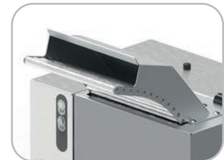
Optional roller slide