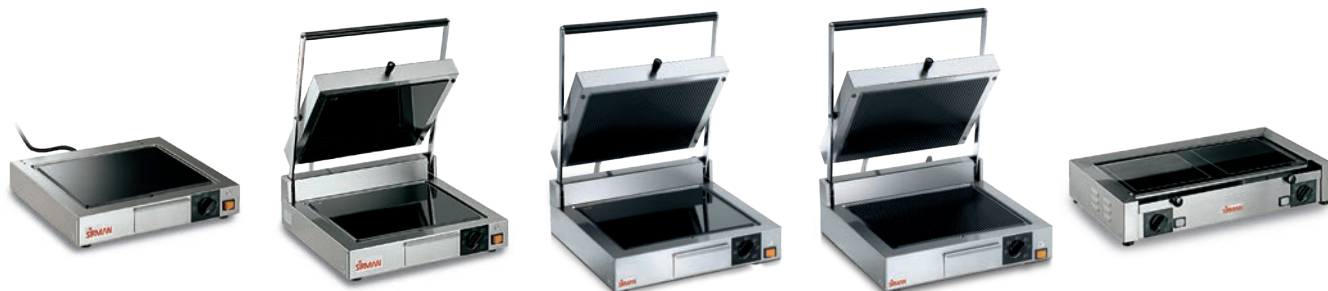
TOP CORT VT