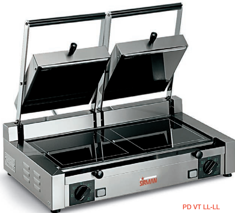
PD VT LL-LL