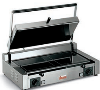
PD VU LL-LL