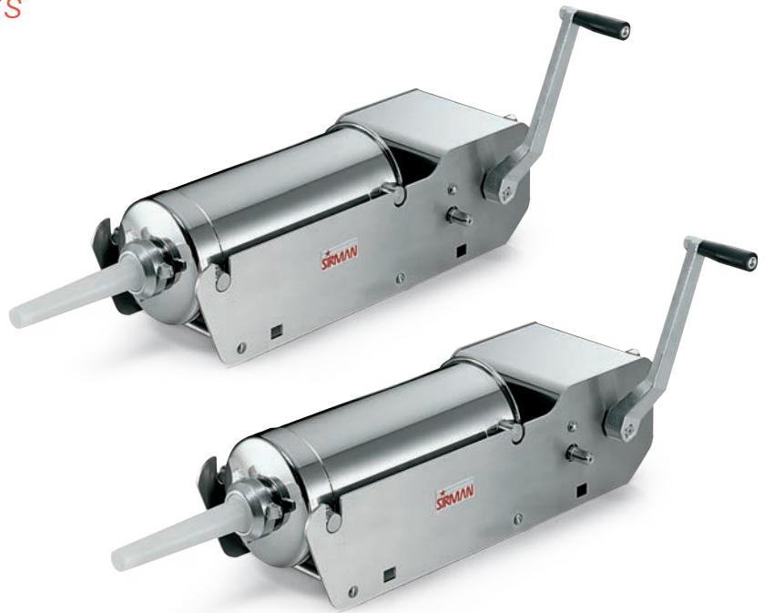
IS 8-16 ARIES