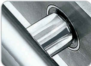
Running on ball bearings